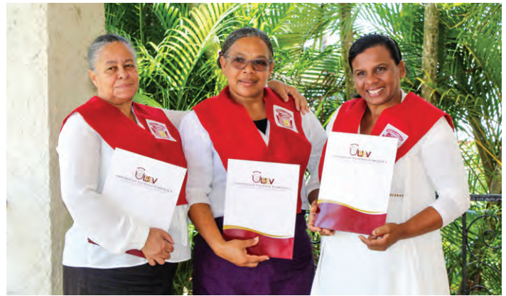
A special award ceremony was planned to present each participant with a certificate for completing the course.