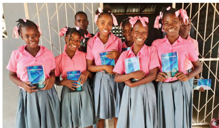
God's Word is powerful and changes lives! Leogane Middle School students are happy to have received a new Bible.