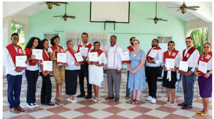
Everyone who took the class thoroughly enjoyed it and learned a lot about how to interpret the Bible.