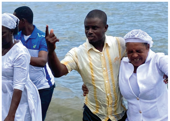
Top: Walking to the ocean is a visual reminder for us to follow Jesus all the days of our lives.