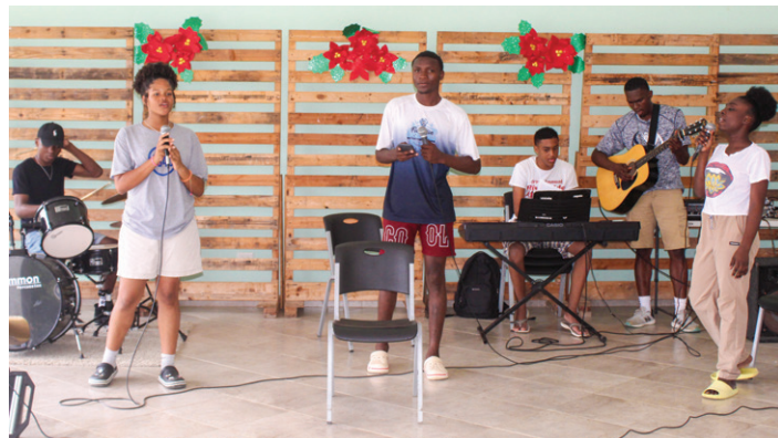
The worship team is very dedicated and practices for hours every Saturday to prepare for the service on Sunday.