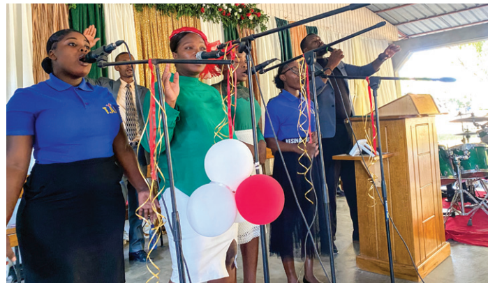
Music leaders helping church members connect with God through worship and praise.