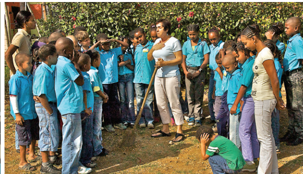
Top: Jesus loves me, this I know, for the missionary told me so.