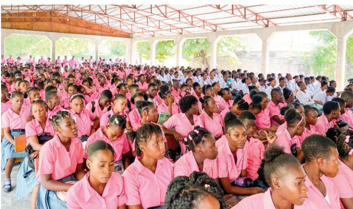
Each Wednesday, the entire high school student body meets for chapel services.